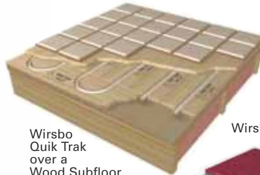
Wirsbo Quik Trak over a Wood Subfloor